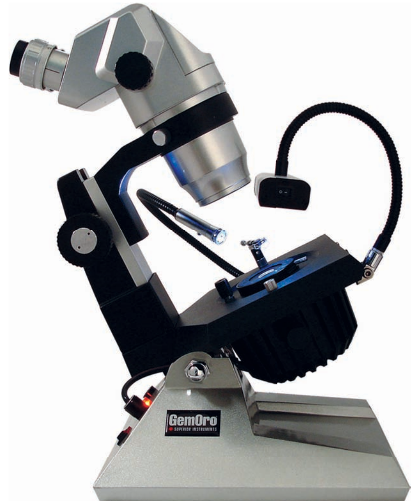
Parts & Features Manual